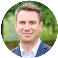
Phillip Johnson Chair